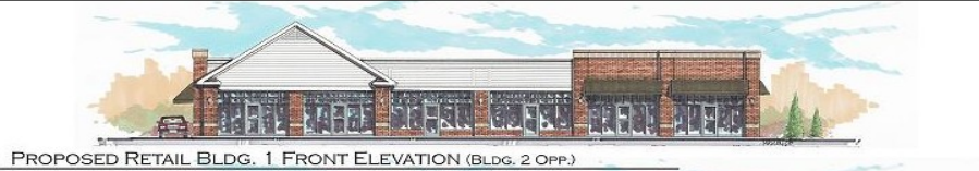
PROPOSED RETAIL BLDG. 1 FRONT ELEVATION (BLDG. 2 OPP.)