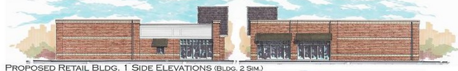
PROPOSED RETAIL BLDG. 1 SIDE ELEVATIONS (BLDG. 2 SIM.)